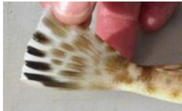
Northern Sand Flathead tail