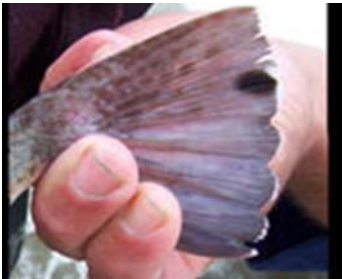
Dusky Flathead tail

Remember to check the tail if you're not sure which one you have caught.