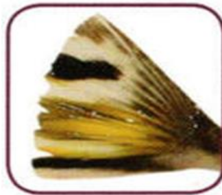
Bartail Flathead tail