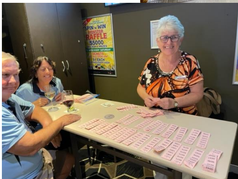
Left: Sorting through left over raffle tickets looking for any winning numbers