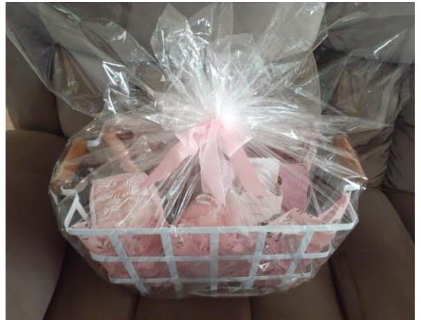
Mother's Day Bonus Basket