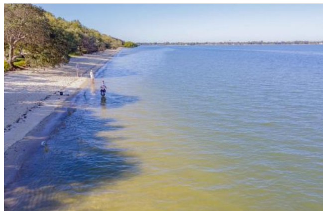
Pebble Beach from the air

If you have put your name down for this comp keep an eye on emails for more information.