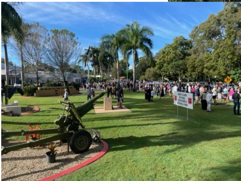
ANZAC Day crowds in the grounds of the RSL