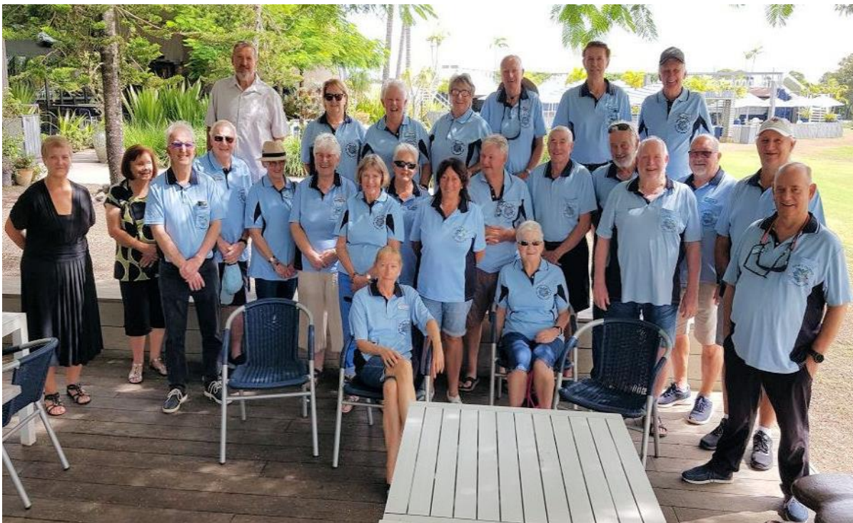
A good number of club members met for coffee and cake at Sandstone Point Hotel on a lovely morning back in April