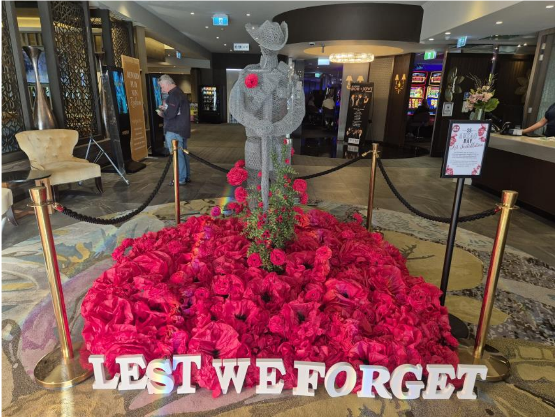
ANZAC Day display inside the RSL