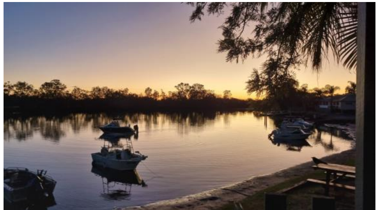
Maroochy River outside the bungalows